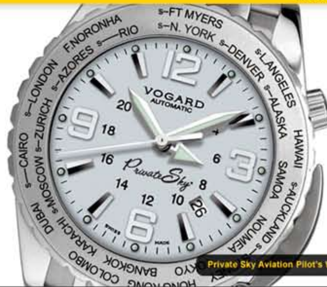
Private Sky Aviation Pilot's Watch